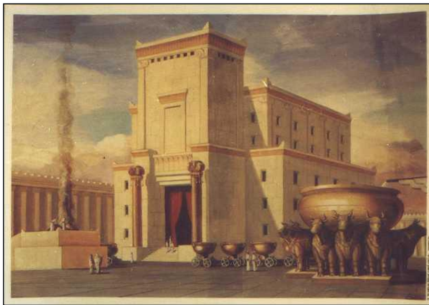
Portions of these notes are adapted from the Life Applications Bible (NIV) (Zondervan)