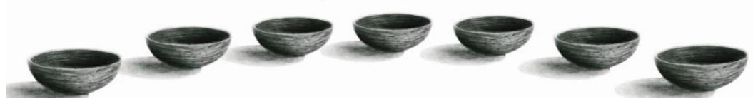
Figure 1: The Seven Bowl Judgments of the Tribulation